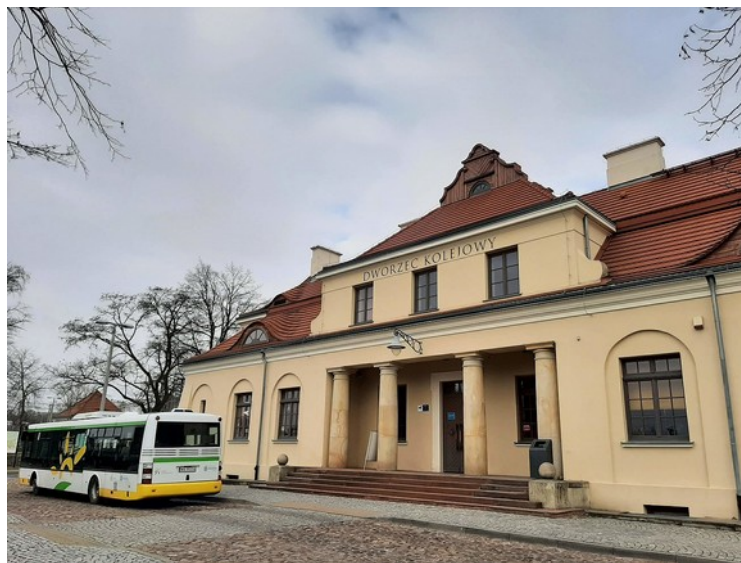
Shuttle bus waiting outside Modlin Railway Station

Warsaw is also reachable by railway from other Polish cities and most capital/major cities of neighbouring countries ( https://www.pkp.pl/en/ ).