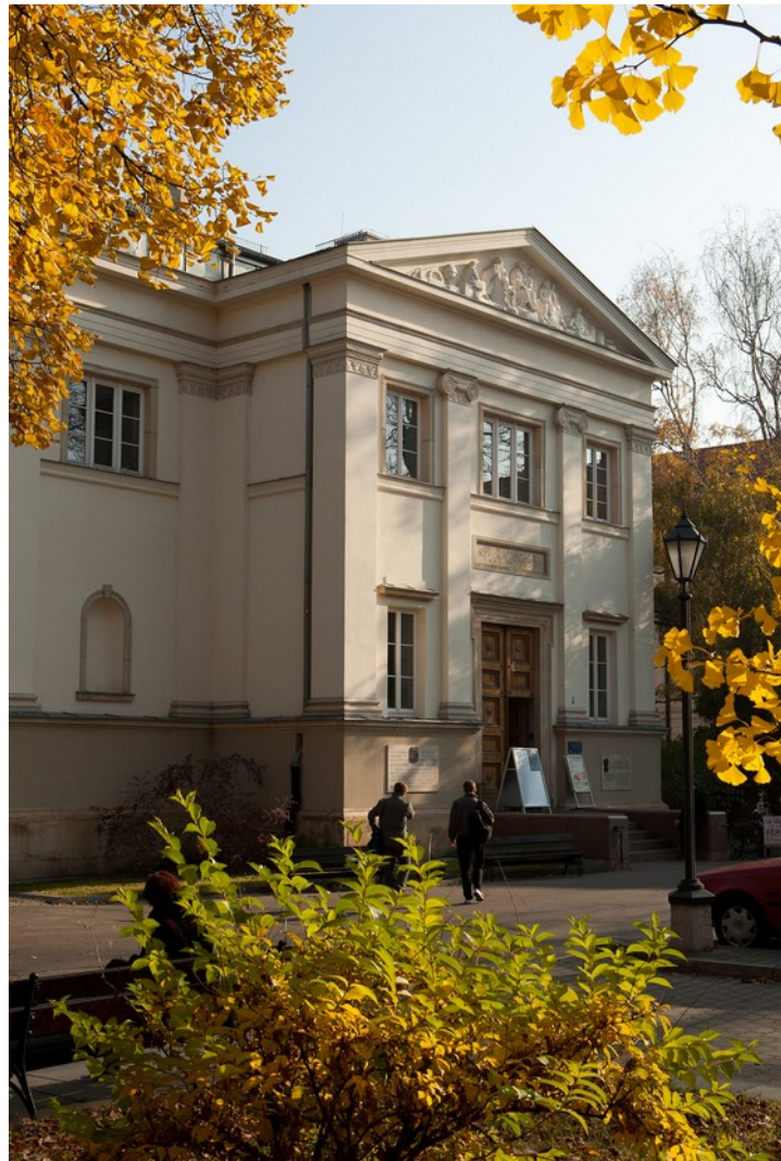
Faculty of Archaeology, Front Entrance

Room 210 is on the first floor – from the entrance lobby take the stairs up and walk straight down the corridor in front of you